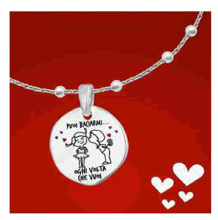
"you can kiss me anytime you want"

Vivian Giolelli 's silver charm is a classic heart with the sentence "we are one" that can be split, perfect for long distance relationships, to remind the loved one that even when separated, "we are one".